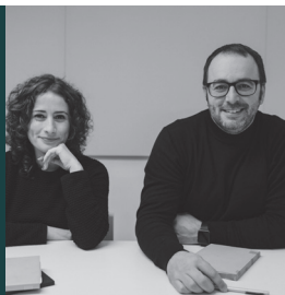
Odos Design Valencia, Spain